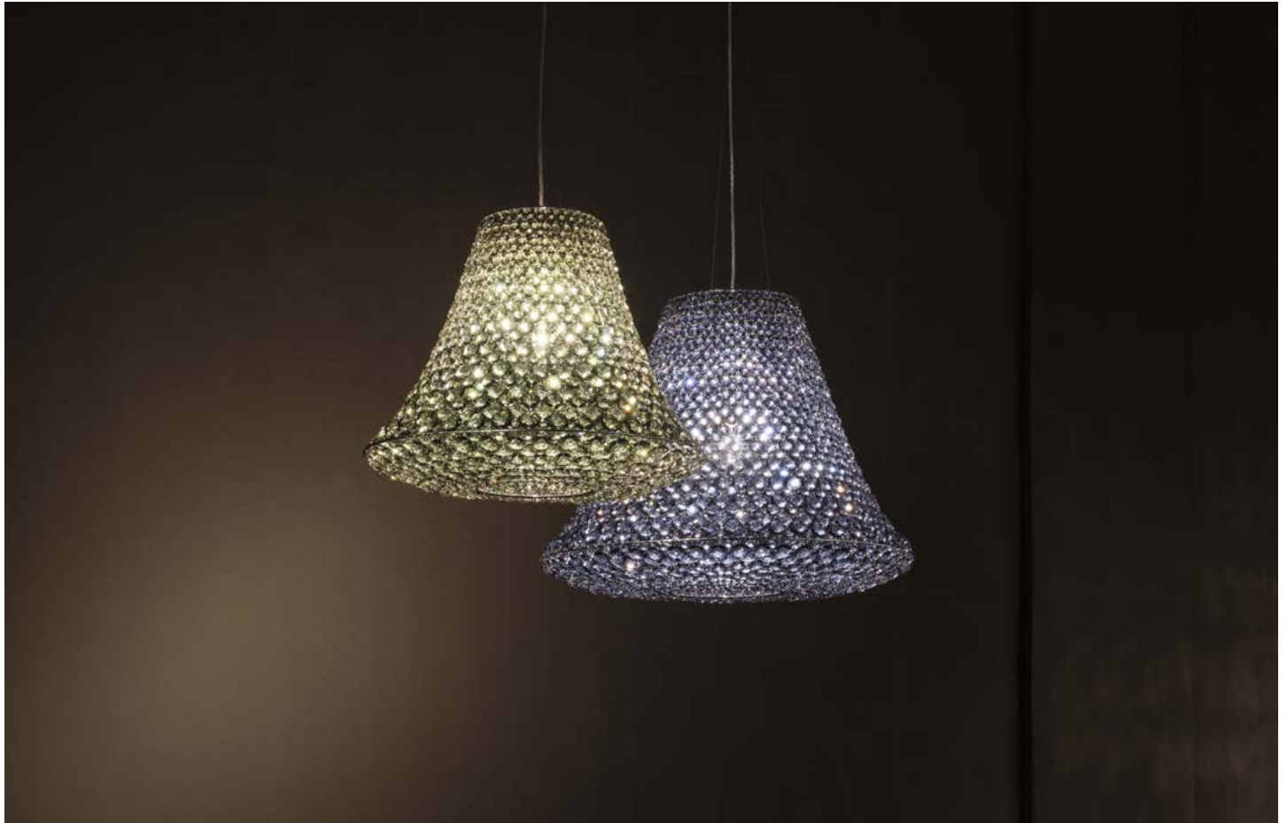
in the picture Viet 52-65